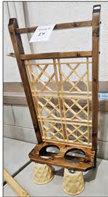
Tim Sutton's Wall Plant Stand and decorative Screen took Honourable Mention. The interior lattice work is done in Japanese Kumiko-style woodwork.