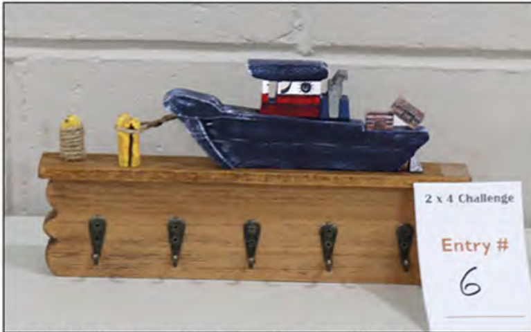
Bob White created a key rack using all hand tools including a coping saw.