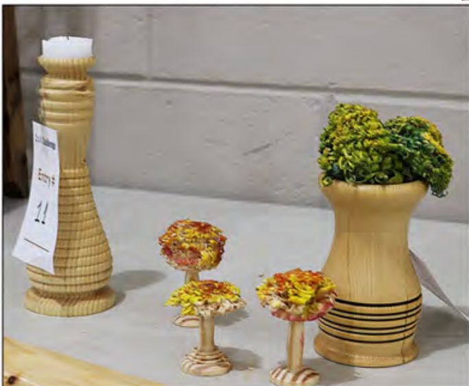
Joe Sebastianelli entered two projects. On the left a lovely turned candle holder. On the right a turned vase and small pedestals for wooden shaving flowers. Great creativity.