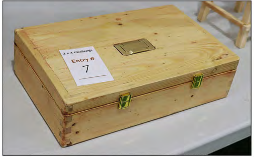
Howard Prout's entry is a nicely constructed utility box with lid and clasp. Howard used box joint corners for sturdy side connections.