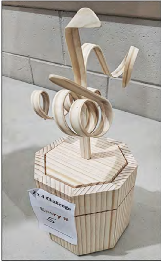
Bogdan Topielski created an octagonal box with precisely fitted corners. The top is free form art shapes all created with a hot pipe.