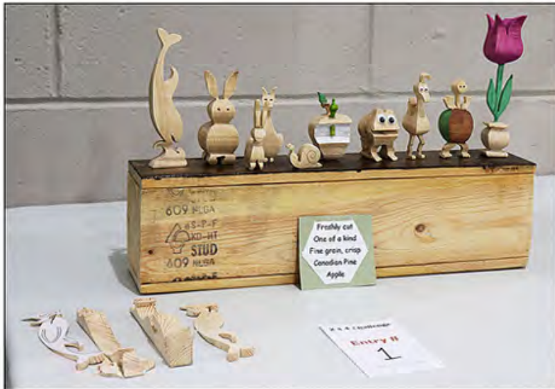
Alan Rundle created a box by cutting narrow strips for the frame. Remaining wood was used for ten different creations made with an 1890s treadle (foot) powered scroll saw. The figures are cut in 3-D using the compound cut technique