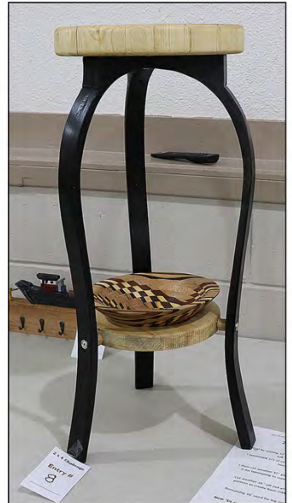
Jim Pozzobon created an elegant piece of furniture with gracefully curved legs. The round seat and shelf add strength and beauty.